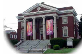
First United Methodist Church 200 E. Center St. • Madisonville

Monday - Thursday 8:00 A.M. to 5:00 P.M. Friday 9:00 A.M. - 2:00 P.M.