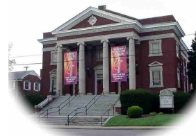
First United Methodist Church 200 E. Center St. • Madisonville

Monday - Thursday 8:00 A.M. to 5:00 P.M. Friday 9:00 A.M. - 2:00 P.M.